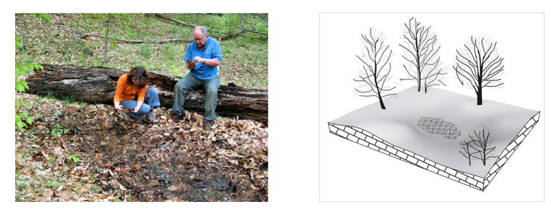
Left panel—typical seepage spring in Scotts Run Regional Park, Fairfax County. Right panel—sketch of seepage spring, showing its connection to nearby topography.

The shallowest of these groundwater habitats, defining groundwater in the sense of water under the surface not exposed to light, can occur less than a foot beneath the ground. Meštrov [3] applied the term "hypotelminorheic" to these shallow groundwater habitats that are vertically isolated from the water table. They are miniature drainage basins, typically less than 100 yards in linear extent that are fed by subsurface water and underlain by either by clay or by some other impermeable material [4,5]. They create persistent wet spots where they emerge to the surface in seepage springs, which is where most of the amphipods are collected (by hand sampling). Few Stygobromus , including Hay's and Kenk's spring amphipods have been collected outside these habitats in the Rock Creek basin. The sketch and photograph below give a sense of the hypotelminorheic and seepage springs.