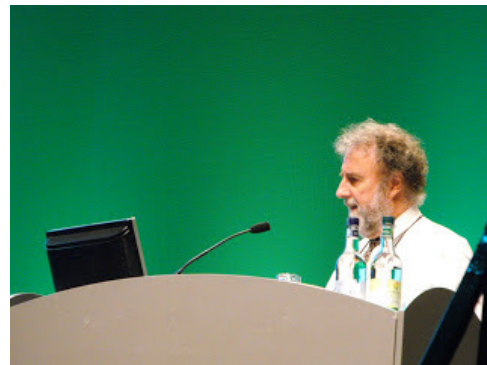
Sir Robert Watson in an opening talk about the need for demand-driven conservation research

Importance of trans-disciplinarity, knowledge exchange and the end-users involvement in designing and conducting scientific research was mentioned as an important baseline in many talks.