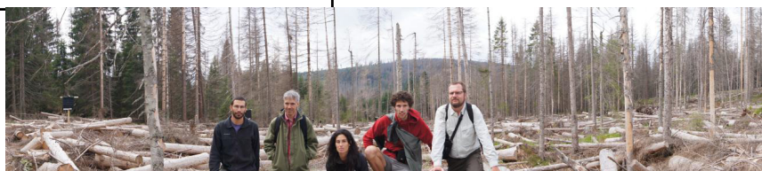
PC members at the site, 2012 autumn

The Šumava National Park (established in 1991 to protect the most valuable parts of the Czech side of the Bohemian Forest) gives home to several rare and endemic as well as endangered species. It forms the largest non-intervention area in the Central-European cultural landscape together with the neighbouring Bavarian Forest NP.