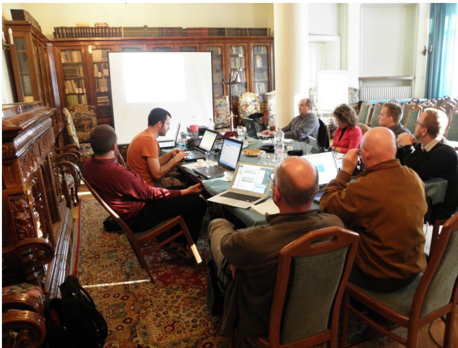
Board meeting in Hungary, March 2012

The Board of the Europe Section held its meetings in Vácrátót, Hungary (March 2012) and in Glasgow (September 2012).